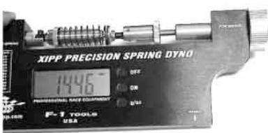
Compress 30mm and lock the knob in place. This time the unit shows 1446g for 30mm travel. This is 1446g/30mm, 48.2g/mm or 48.2kg/m