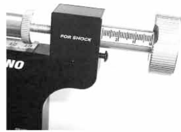
This time we use 30mm instead because the shock travel is much longer and we get a more accurate reading this way