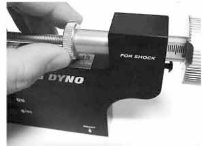
Now, lock the adjustment using the round knob as shown