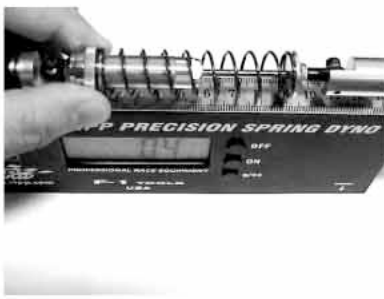
This is another example which shows a longer shock measurement procedures and related calculations