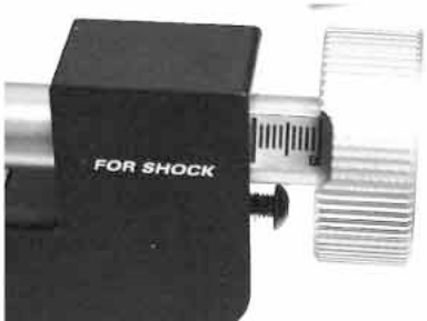
This picture shows the 10mm marking. At this point, your shock should move freely for at least 10mm of travel