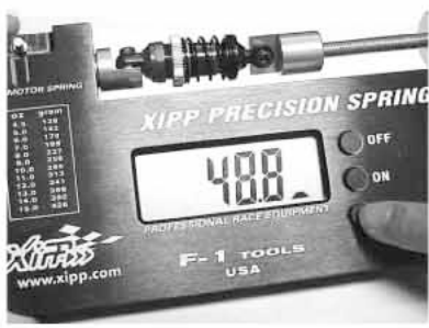
Press the unit button and it's showing 48.8oz per 10mm. Divide this by a constant 6.3 and you get 7.75lbs/in