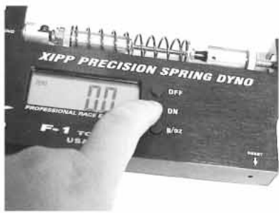
Now, zero the dyno by pressing the "ON" button again