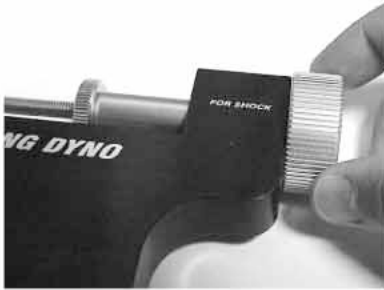
Compress the spring and lock the unit by turning the knob clockwise