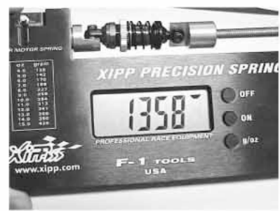
Unit is showing 1358g of pressure with 10mm compression. Divide 1358 by 10mm, that's 135.8g/mm or 135.8kg/m