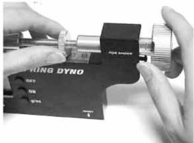
Do not preload the spring, adjust this knob by turning. Tune the unit for 10mm travel distant for your shock