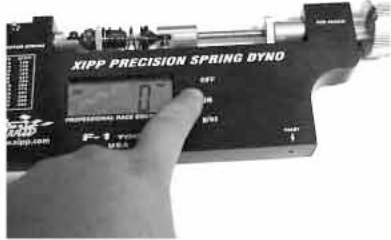
Zero the unit by pressing the "ON" button